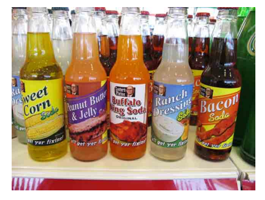
Sweet Corn, Peanut Butter & Jelly, Buffalo Wing, Ranch Dressing, Bacon Soda