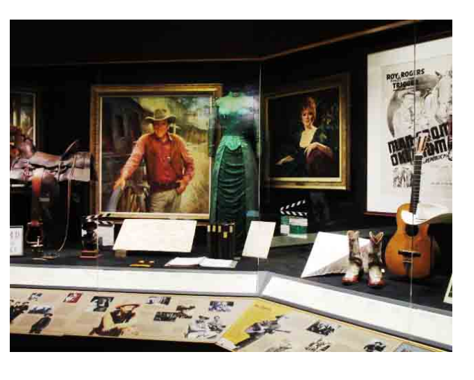
How about Gunsmoke?