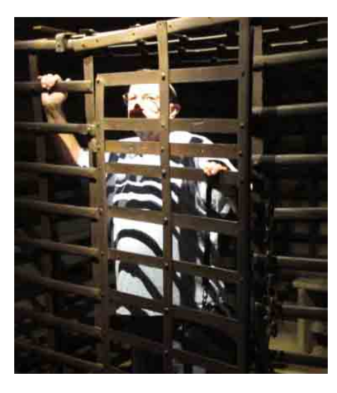
Earl in jail?