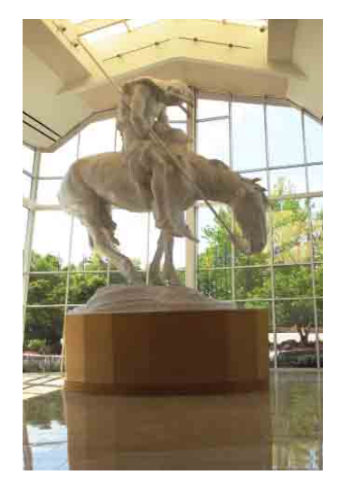
A huge sculpture depicting "The End of the Trail"

The National Cowboy & Western Heritage Museum features a superb collection of classic and contemporary western art, including works by Frederic Remington and Charles M. Russell, as well as sculptor James Earle Fraser's magnificent work, The End of the Trail. The exhibition wing houses a turn-of-the-century town and interactive history galleries that focus on the American cowboy, rodeos, Native American culture, Victorian firearms, frontier military and western performers. Outside, beautifully landscaped gardens flank the Children's Cowboy Corral, and interactive children's space. As usual, I took too many pictures. Here are a few of the good ones.