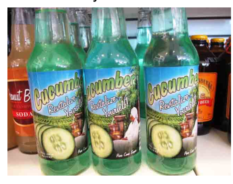
Cucumber Soda - Uggg!!!