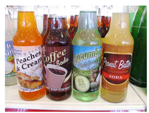
Peaches and Cream, Coffee, Cucumber, Peanut Butter