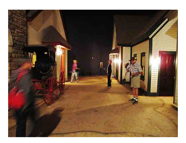
We visited a village of 20 western town shops.