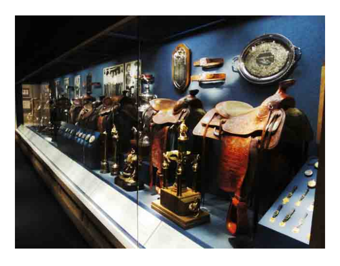
Saddles and more saddles along with displays of spurs, bridles, barb wire, chaps, hats, anything you can think of.