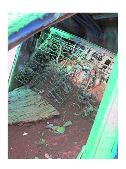
Many still have remnants of seats in them.

My question: How do we know they were Cadillacs? The answer: look at the tail lights. This example even still has the trailer hitch on it.