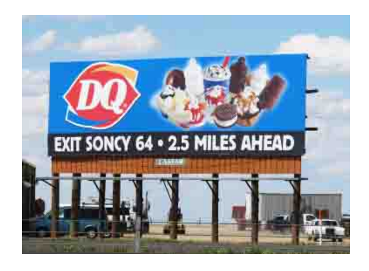
Still looking for Dairy Queens!

Hey! This is been a real odd day. After getting back to camp, I availed myself of a nap! This afternoon I also took a dip in the pool. I figured I might as well. Who knows what we will find at our next stop in Oklahoma City. We will be there for three nights before heading on to Branson. It's hard to imagine that I've been on the road for one whole week. Thanks, once again, for coming along with me. Bye for now