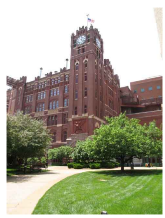
The big beautiful brick buildings were well maintained and the grounds well taken care of and manicured.