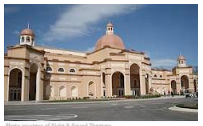
The outside of the theater. Very fancy, eh?