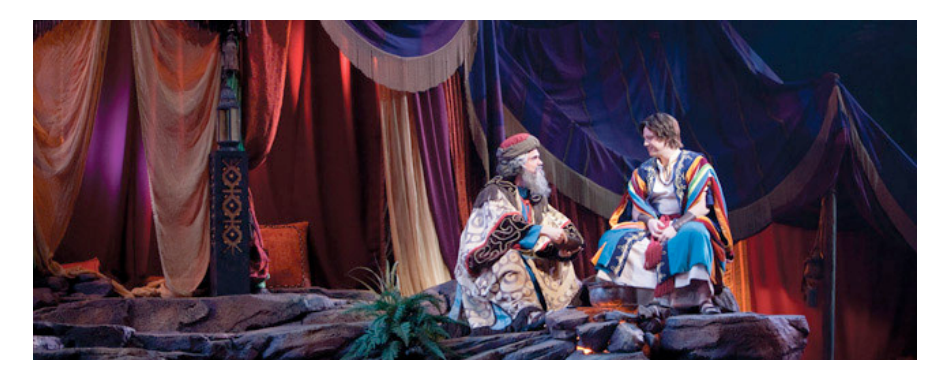
Very colorful costumes and expert lighting effects.