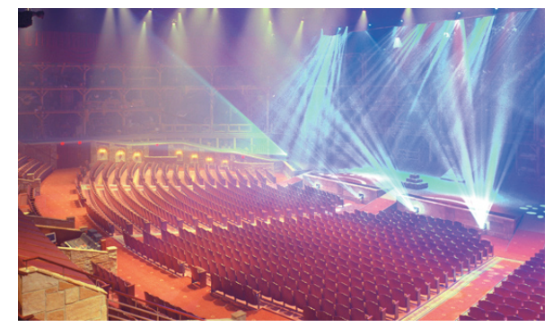
A view of the main stage seating area