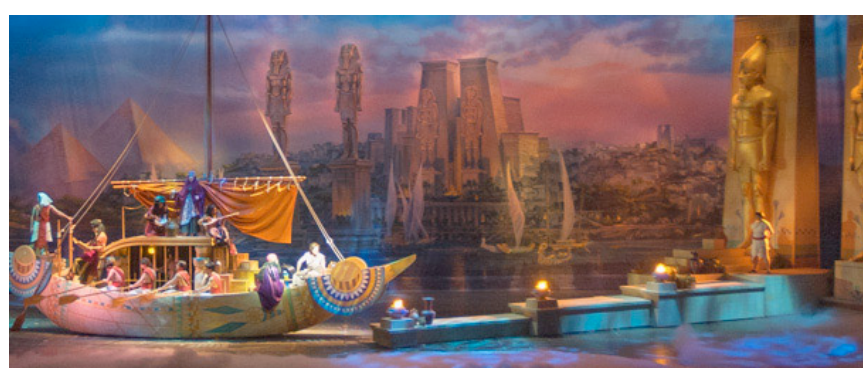
You can tell the huge scale of the stage and set by the size of the people in the boat.